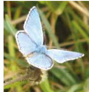
Adonis blue butterfly

Purbeck is home to many nationally rare species. Some, like the ladybird spider, are only found in Dorset. Fortunately much of the area is managed by sympathetic landowners or conservation bodies like the National Trust, so their future is in safe hands.