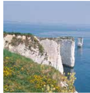
Old Harry Rocks

The Purbeck Way passes through some of the most varied and spectacular scenery in Britain. After leaving the River Frome and its water meadows, the route continues through heathland, woodland and grassland before arriving at the dramatic scenery of England's first natural World Heritage Site, the 'Jurassic Coast'. The route then continues along the South West Coast Path from Ballard Down to Chapman's Pool. North of Wareham there are links with the Wareham Forest Way and beyond to Blandford and Christchurch via the Stour Valley Way.