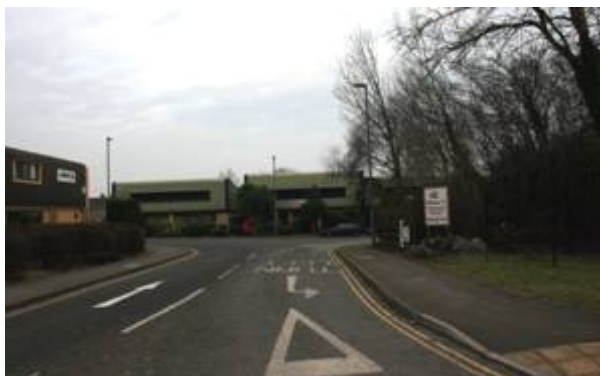
Figure 67: Riverside Park; Wimborne Station formerly lay in the left foreground. A remnant of the railway embankment can be seen on the right.

Figure 64 shows the present day historic urban character types. The western side of the area is dominated by Victorian suburban villas interspersed with inter-war suburban housing, apartments and modern infill. An area of former industrial activity south of New Borough Road is now marked by a depot, a medical centre and apartments. The site of the former Wimborne station is marked by the Cattle Market and industrial units on the east side of the suburban villas (Figure 67). This industrial estate continues to the south and east of Leigh Park.