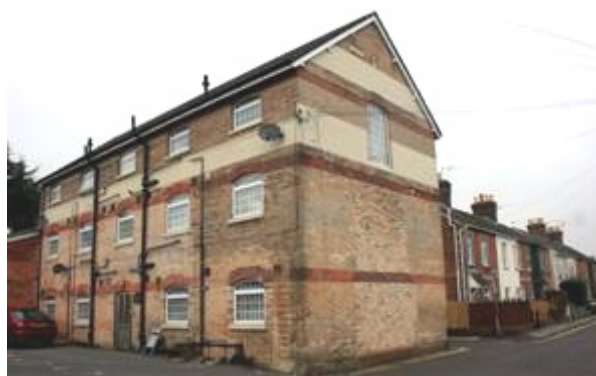
Figure 72: 'The Old Granary', 1 Station Terrace, the site of the former Dorset Modern Dairy

village of Leigh Common with the town and also forms the northern boundary of the character area. The archaeological character of the Leigh Road and Poole Road areas is likely to comprise remains of low-level medieval and post medieval activity. The western part of the area was characterised by Victorian housing and industrial developments associated with the railway during the 19 th century. Archaeological deposits in this area will reflect these developments.