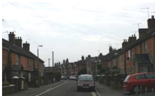
Figure 70: View south along Grove Road