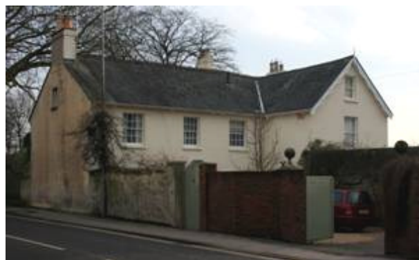
Figure 66: Stourfield House, 16 Poole Road