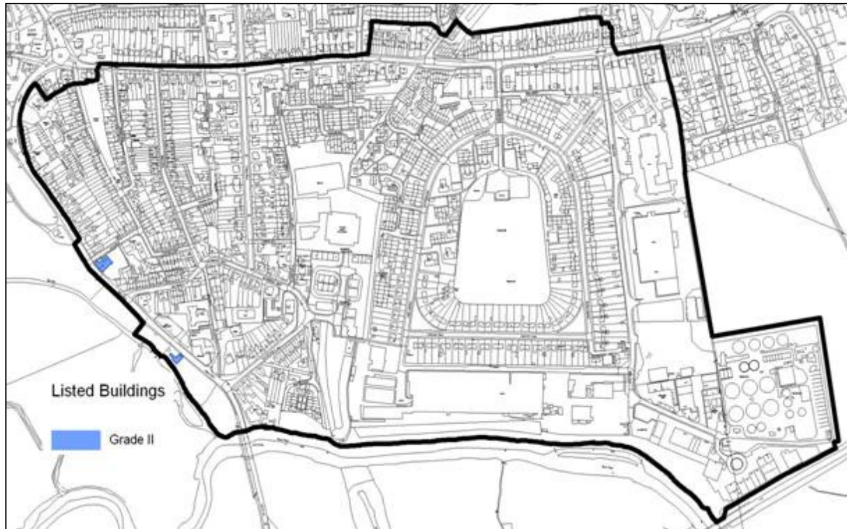
Figure 73: Listed Buildings in Historic Urban Character Area 3