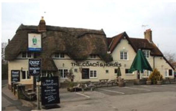
Figure 65: The Coach and Horses, 73 Poole Road; 17 th century Inn