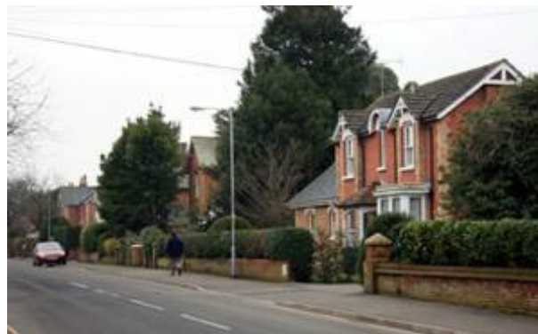
Figure 69: Victorian Suburban Villas, The Avenue

Late 19 th and early 20 th century industrial Buildings: Number 1 Station Terrace (Figure 72); Perry Court, New Borough Road