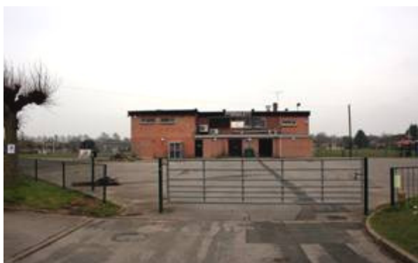
Figure 68: Leigh Park, the home of Wimborne RFC